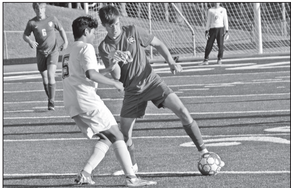
The Towns County Indians in action at home during last Friday's Region 8-A Public match with ninth-ranked Commerce.

Next, the boys lost their game to No. 2-ranked Lake