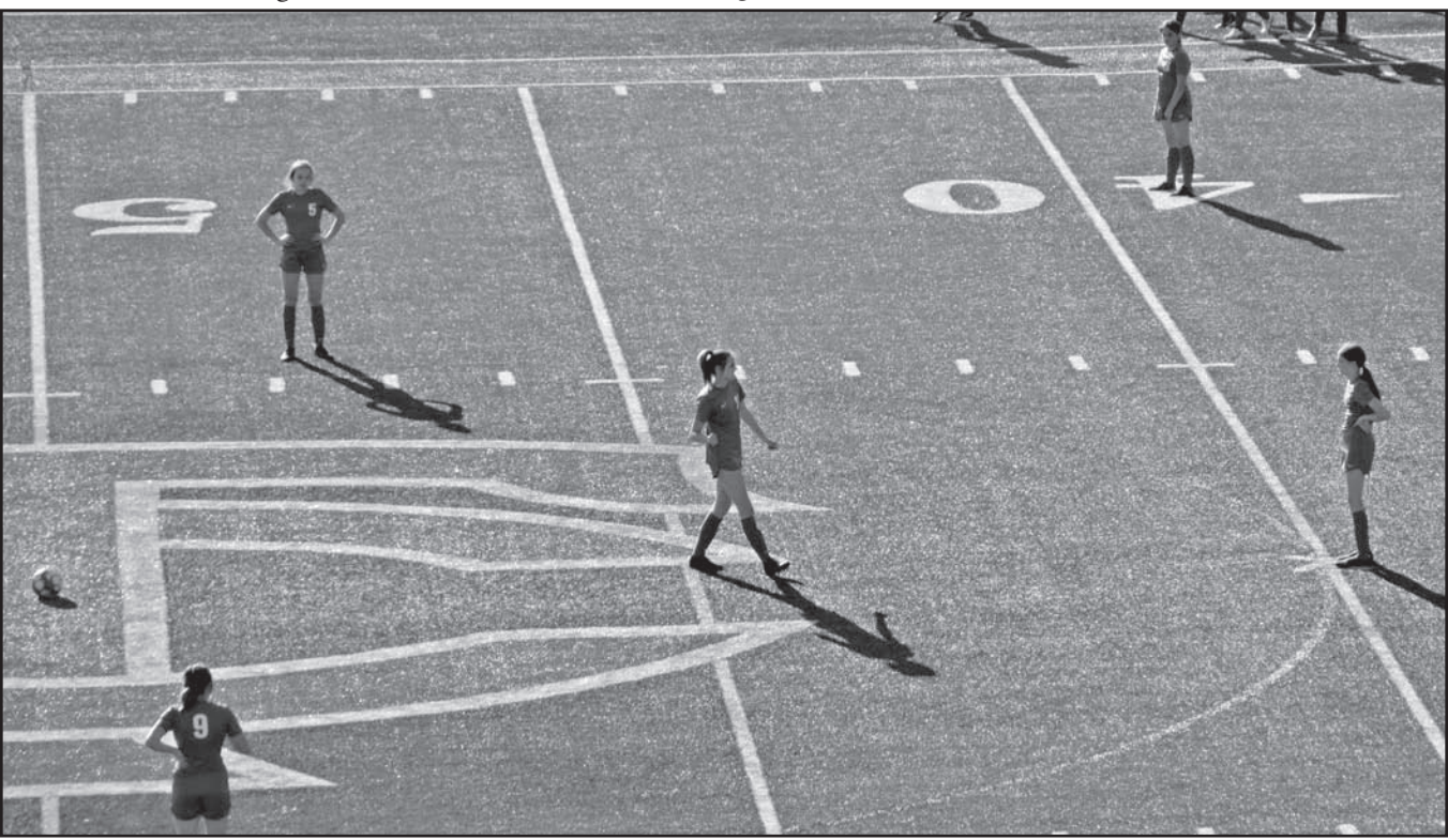
The Lady Indians prepare for kickoff during last week's region clash with Lake Oconee Academy.

The Lady Indians and Indians were set to play after press time on Tuesday, March 8, in another away region game versus Social Circle High School.